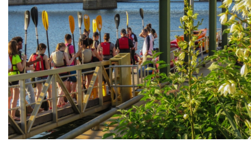
On the Schuylkill Banks