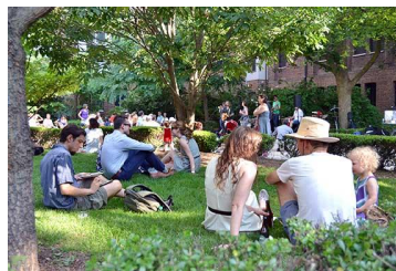
At the Penn Museum