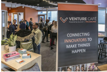
At the Science Center