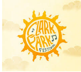
In University City