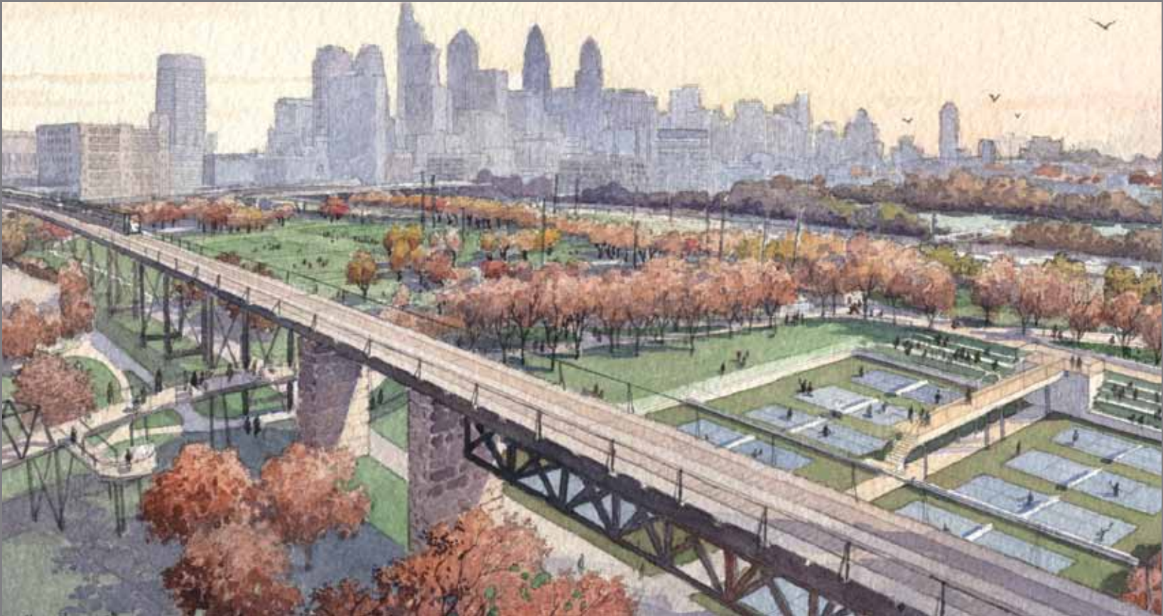
Penn Park, Recreation & Intercollegiate Athletics (2011 completion) $46 million

These Penn Connects projects represent only a sampling of the work that is transforming the campus and infusing hundreds of millions into the local economy.