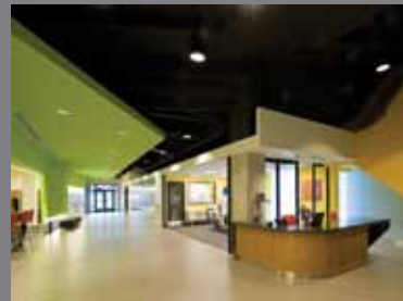
The Radian, mixed-use student housing (completed 2008) $70 million