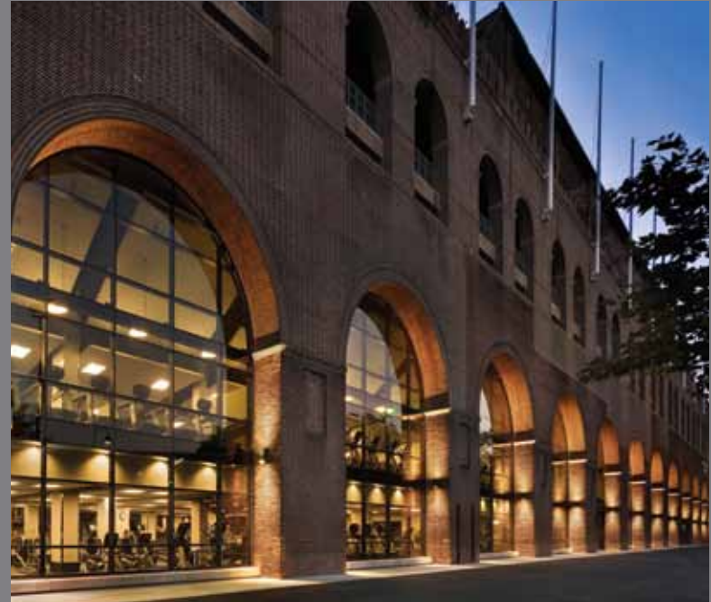
Weiss Pavilion, Recreation & Intercollegiate Athletics (completed 2010) $27.7 million