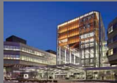
PERELMAN CENTER FOR ADVANCED MEDICINE (COMPLETED 2008) $302 MILLION