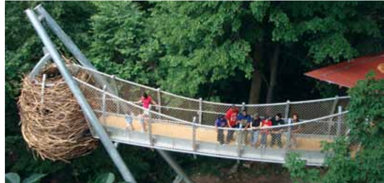
The Penn Relays, basketball and football games, educational and business conferences and cultural events at the Annenberg Center, The Morris Arboretum (pictured above), along with the University Museum, World Café Live, Institute of Contemporary Art and Kelly Writer’s House drew 618,000 visitors and generated $11 million in spending in fiscal 2010.

Students, patients and visitors to Penn spend millions more on everything from books and supplies to restaurants, hotels and off-campus housing. A primary benefactor of this ancillary spending is the successful retail district that Penn has been instrumental in developing on campus and throughout University City.