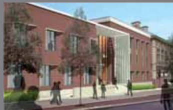
Golkin Hall, Law School (2011 completion) $33.6 million