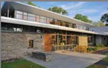
Morris Arboretum Horticulture Center, Phase 1 (completed 2010) $11 million