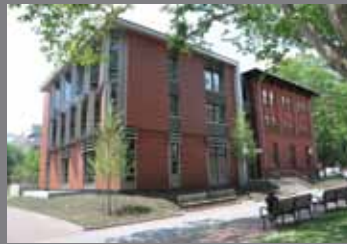
Music Building, School of Arts & Sciences (completed 2010) $15.9 million