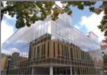
Annenberg Public Policy Center (completed 2009) $34.5 million