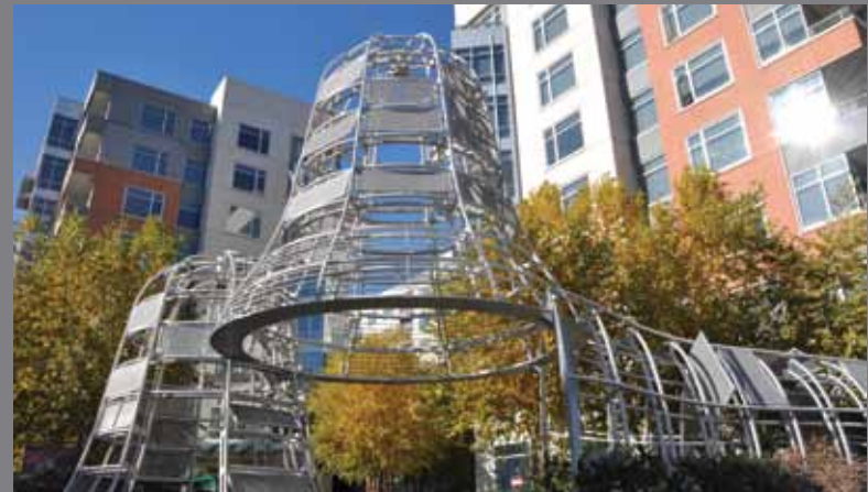
Domus, mixed-use (completed 2007) $100 million