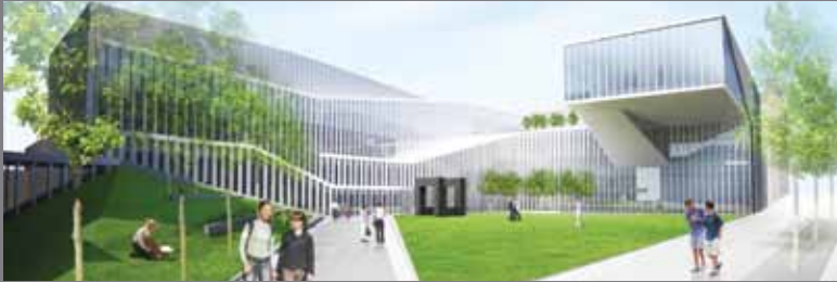
Krishna P. Singh Nanotechnology Center, School of Engineering & Applied Science/ School of Arts & Sciences (2013 completion) $80 million