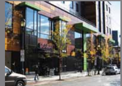
The Hub, mixed-use student housing (completed 2006) $23 million